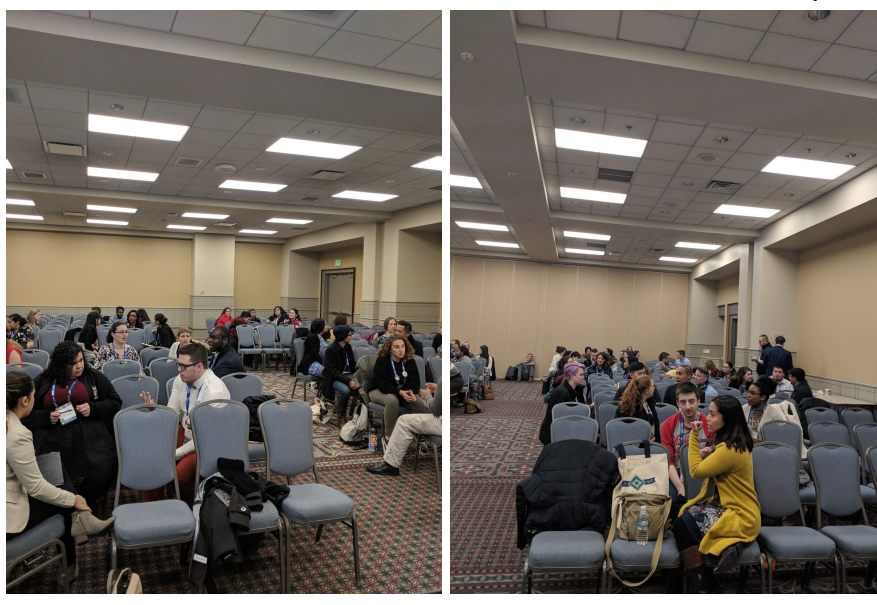
selected shots of the audience for our workshops

Feedback: We continued to receive highly positive feedback for both our workshops, as well as ample praise for the great work happening at Lehigh. Perhaps one of the most impactful demonstrators of our success has been the number of individuals who have reached out to me to have conversations as a follow-up to our LUally session specifically. As a result of presenting our work at both the NASPA Multicultural Institute and NASPA's Annual Conference, it is clear that Lehigh is being established as a leader in the area of LGBTQ+ allyship engagement.