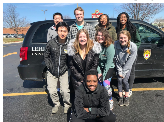
Day of Departure