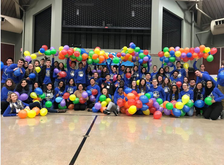
My LeaderShape Cluster Family