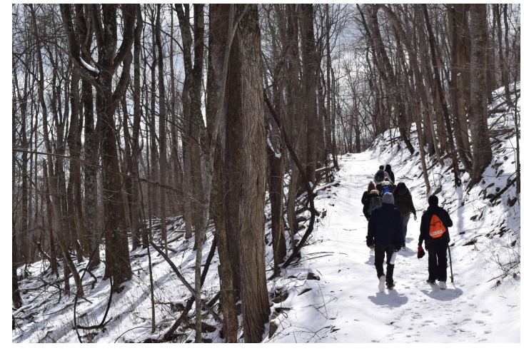
Hike on Big House Mountain (VA)