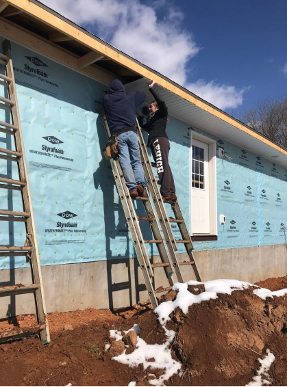
Installing Drip Edges