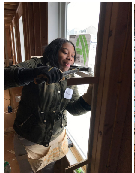
Securing New Windows