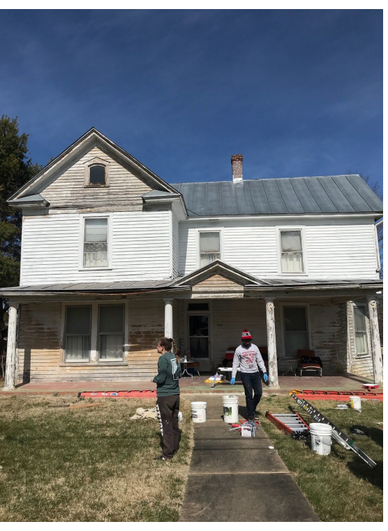
Home Restoration After