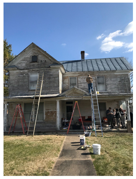
Home Restoration Before