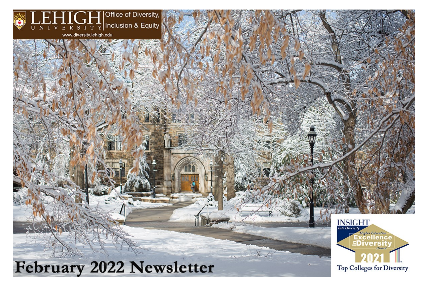
Check out the latest from the Office of Diversity, Inclusion & Equity!