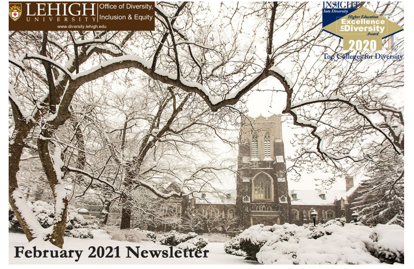
Check out the latest from the Office of Diversity, Inclusion & Equity!