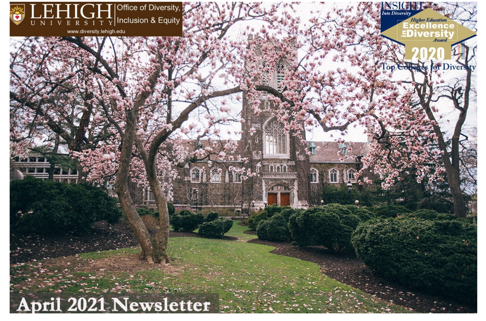
Check out the latest from the Office of Diversity, Inclusion & Equity!